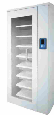
Rigid Endoscope Storage Cabinet