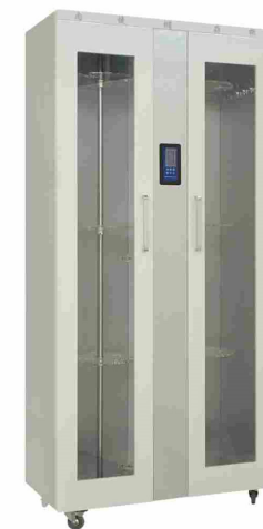
Flexible Endoscope Storage Cabinet